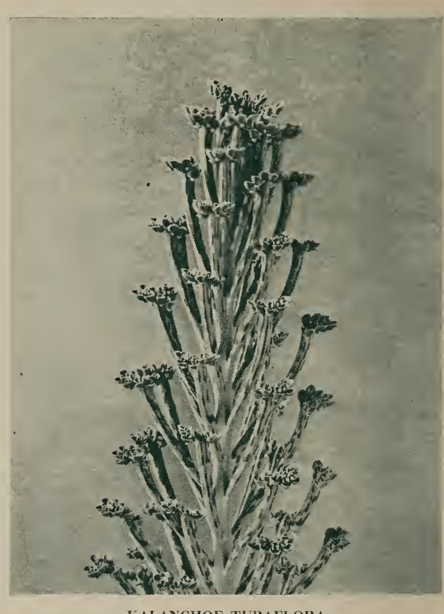
KALANCHOE TUBAFLORA One of a genus of curiously interesting succulents